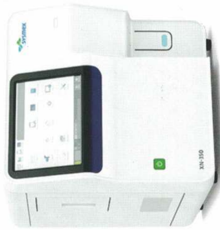
Sysmex XN-330 6 Part