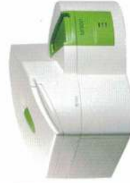
Union YHLO (Fully Automated Immunology Analyzer ELISA)