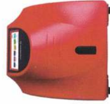
MISPA-i3 Automated Protein Analyzer